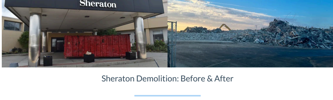
Sheraton Demolition: Before & After

The demolition portion of the project is scheduled to be fully completed by early 2025.