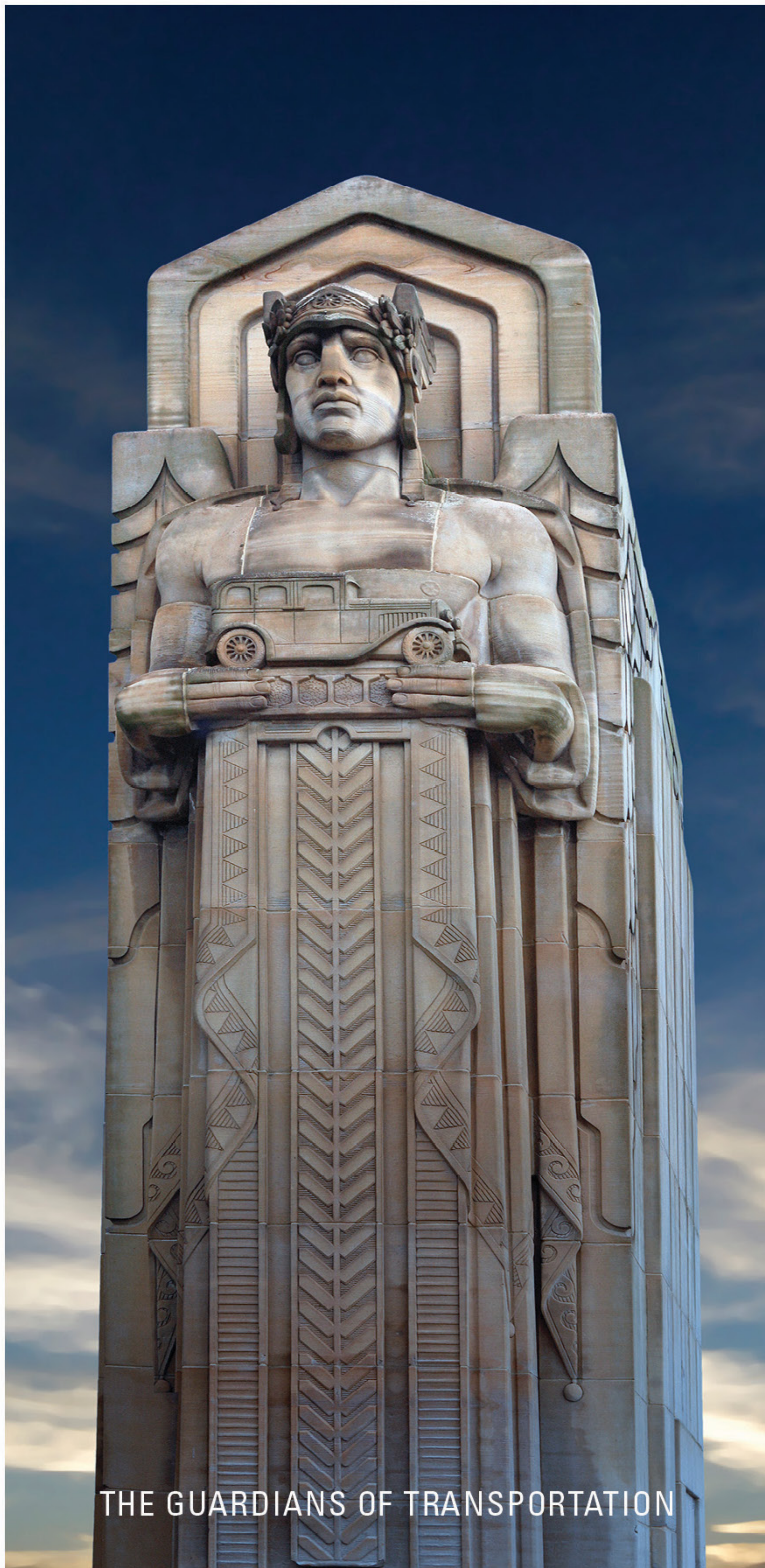
THE GUARDIANS OF TRANSPORTATION